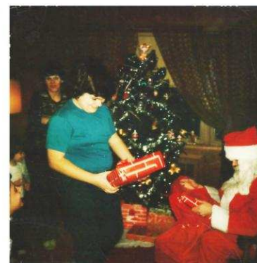
Christmas Eve - 1976